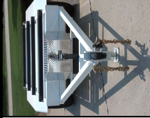
ET440 with Storage Box Option