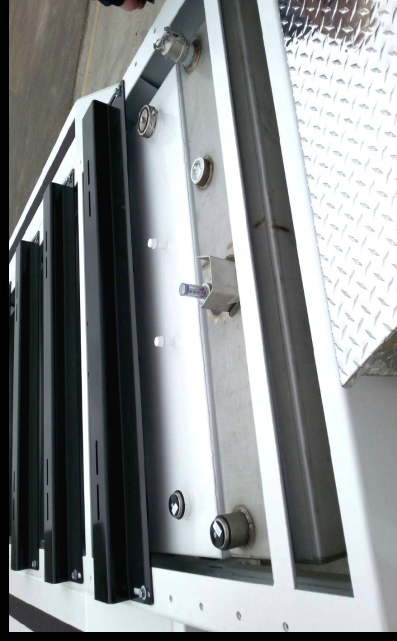
ET440D with 400 Gallon Diesel Tank and Optional 40 Gallon DEF Tank