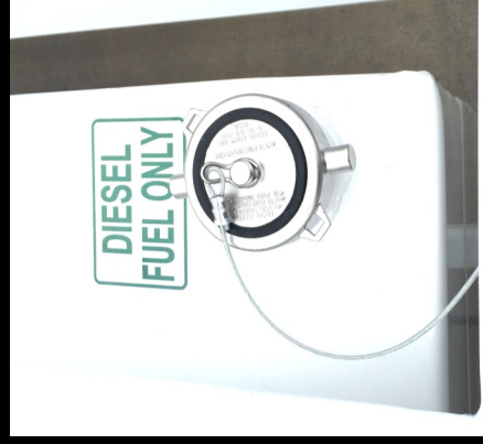
ET440D Removable 400 Gallon Diesel Tank with 3" Rear Fill / Auxiliary Port