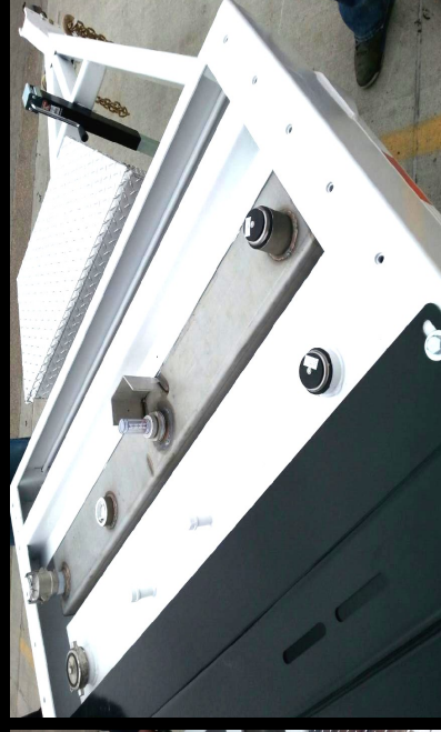
ET440D Diesel Tank Fittings and Optional DEF Tank Fittings