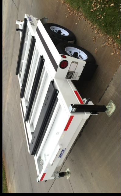
ET440D Multi-Position Engine and Pump Mounts