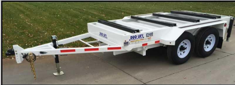
ET440D Engine Trailer (D.O.T. Compliant)