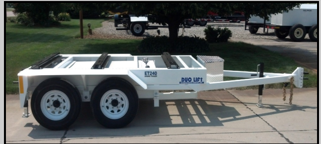
ET240 Engine Trailer