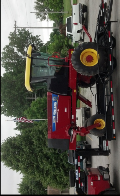
Windrowers can be Loaded without a Header