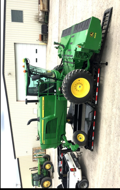
Loading a 16' Rotary Disc Windrower on a SW30D