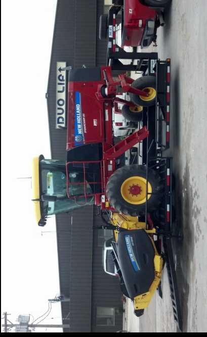
Unloading a 16' Sickle Windrower from a SW25D