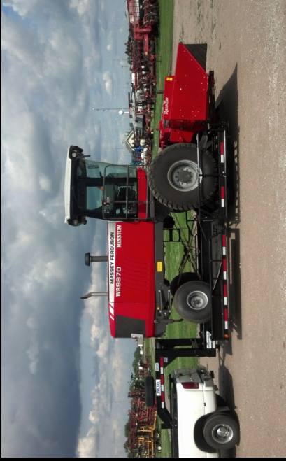
Loaded 16' Rotary Disc Windrower on a SW25D