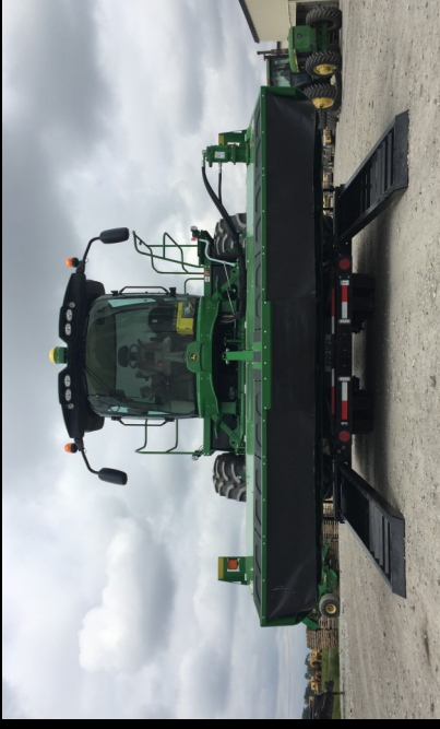
Rear View Loading Position with Slide Out Roller Assisted Ramps.