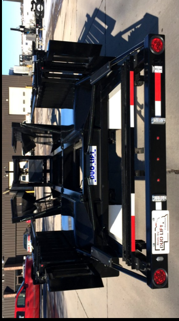
Folded Transport Position Using Dual Spring Lift Assist for Folding All Platforms. Optional: 801158 - Amber Strobe Light Package