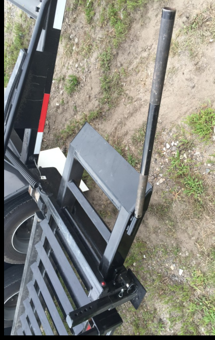
Ramp Lifting Tool Now Standard