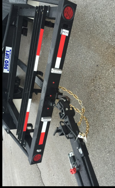
801232 - Rear Hitch Option SW25D & SW28D 801328 - Rear Hitch Option SW30D