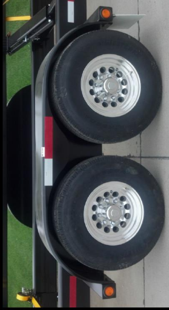
60291 - 235/85R LRG Steel Belted Radial Tire On Aluminum Wheel