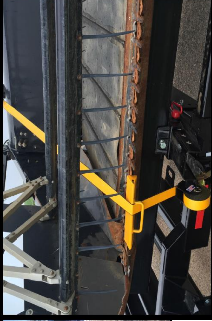
801197 - Sickle and Guard Cover