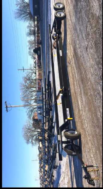
"NEW" 2017 XL Series Head Hauler Trailers Include: Ball Coupler, E-Z Hook Up Extension Tongue, Extended Coverage Front Steel Fenders with Gravel Guard and Two Wheel Electric Brakes. (DLT32XL Shown)