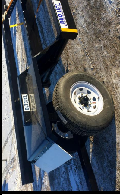
801003 - Extended Coverage Front Fender with Gravel Guard