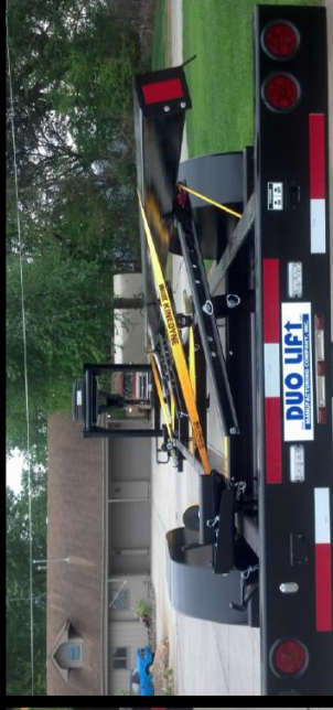
801158 - LED Amber Strobe Light Package For D.O.T. Models