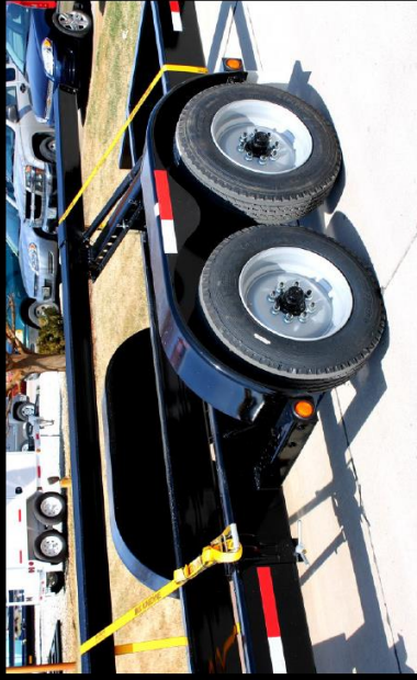
60237- 8000 Lb. Torsion Axle and 17.5 Tire Option For D.O.T. Models