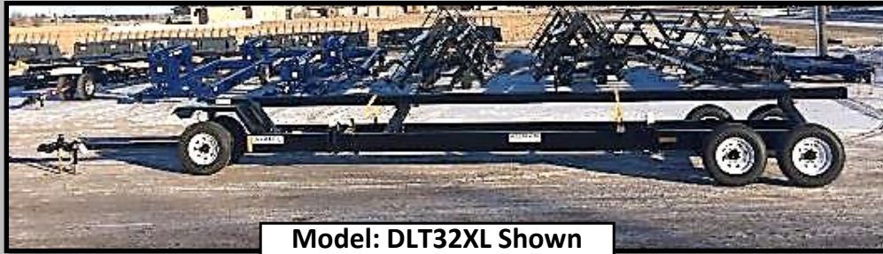
Model: DLT32XL Shown