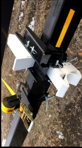
Adjustable Header Support Chock, Self Aligning Strap Ratchet Bracket, Flat Header Support Insert and Strap Wrapper. Optional U-Saddle Header Support Insert Shown in Storage Location